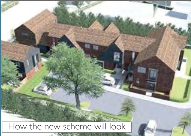
How the new scheme will look