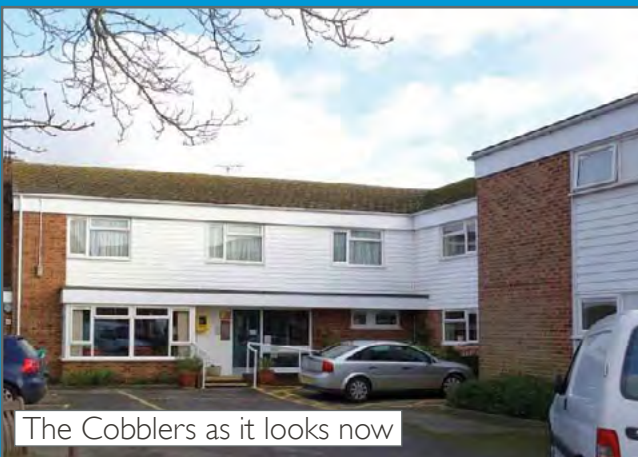
The Cobblers as it looks now